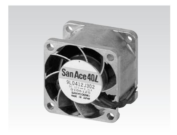
Fig. 2: Long life fan "San Ace 40L"

The long life fan noted in this technical report is the "San Ace 40L". Compared to the 3 standard fans (conventional models) that are required to work the same amount of time, CO<sub>2</sub> emissions decrease 27% with the long life fan, which greatly reduces the overall effect of the fan on the environment. Since only one fan is required during this long period of time, we can also say that the long life fan is virtually maintenance free. Fig. 2 shows a photograph of the "San Ace 40L" fan.