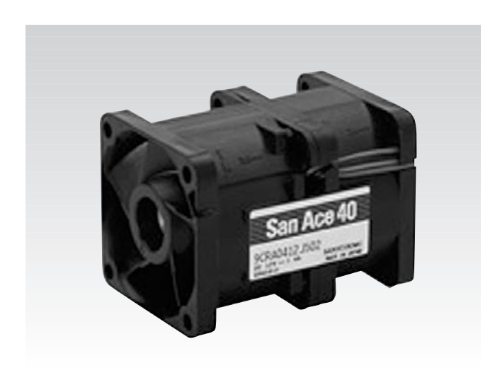
Fig. 3: "San Ace 40" CRA type

The types of fans that customers require have also begun to change. Recently, there is increasing demand for fans that can be controlled fan speed by PWM signal from the equipment <sup>(*3)</sup>. When these fans are installed to equipment, it allows the customers to freely perform detailed controls. This allows customers to only output the cooling abilities when they are required, allowing a drastic reduction in energy consumption. Depending on how the customers plan on operating the fans, these controls provide an opportunity to effectively reduce energy. our company is working to provide this system in a wide variety of products.